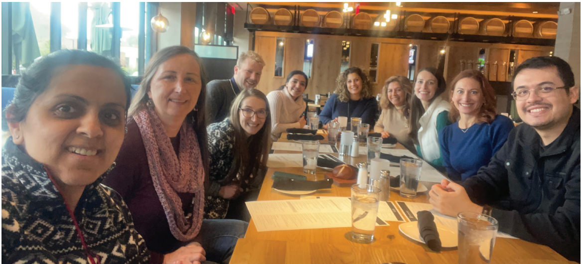
LFS Study Team having a 100% vaccinated lunch, November 2021